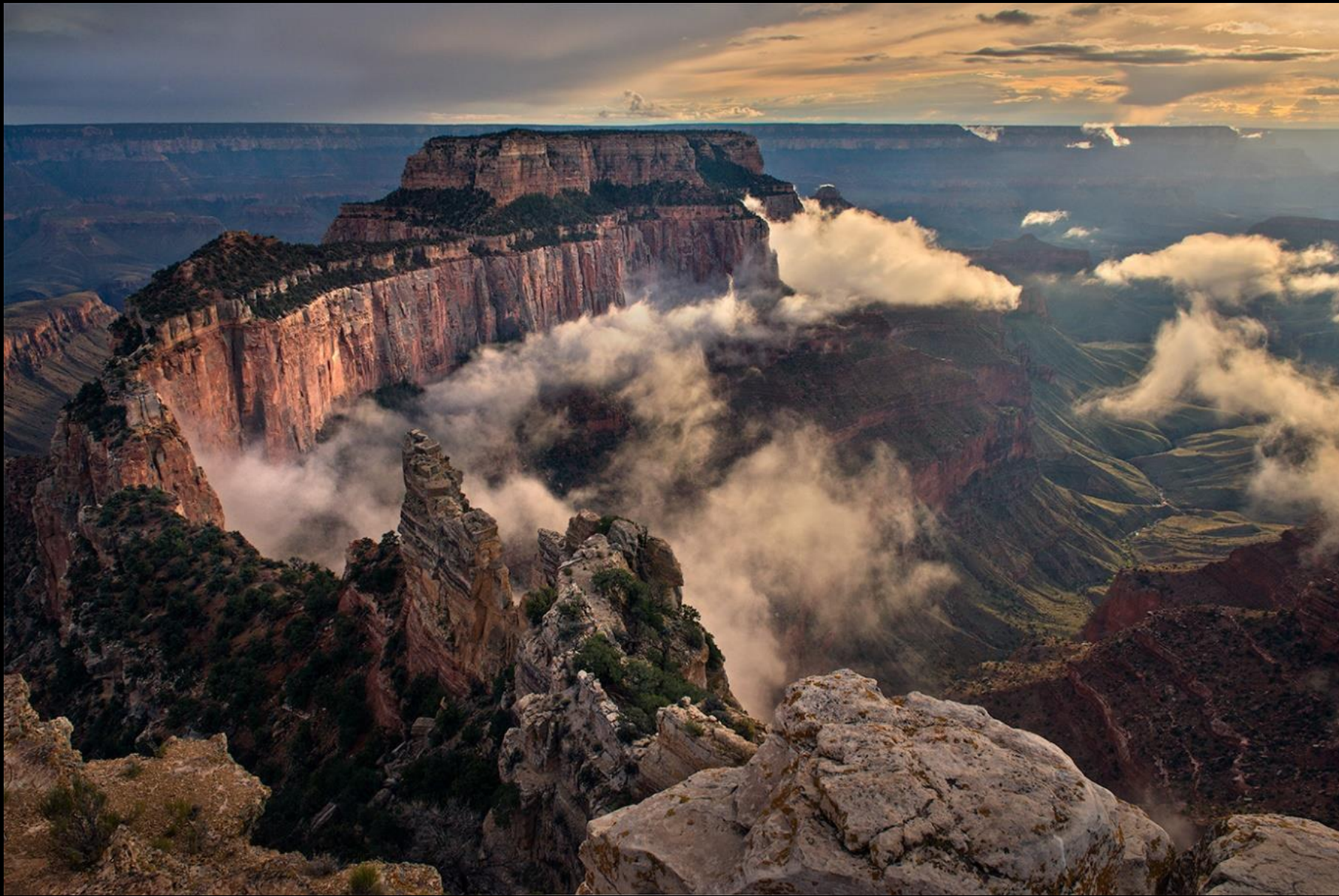
WOTANS THRONE GRAN CANYON