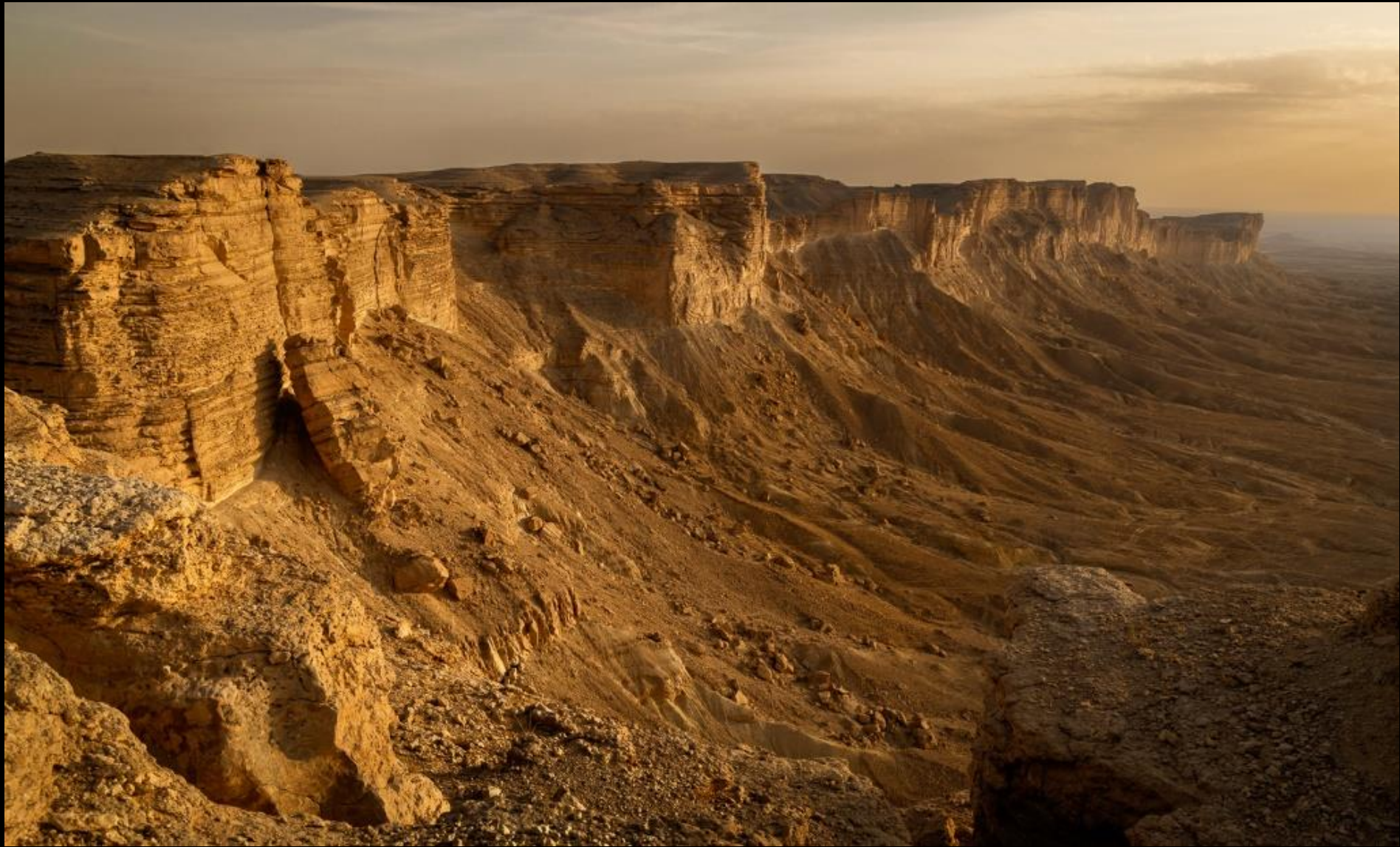
TUWAIQ MOUNTAINS SAUDI ARABIA