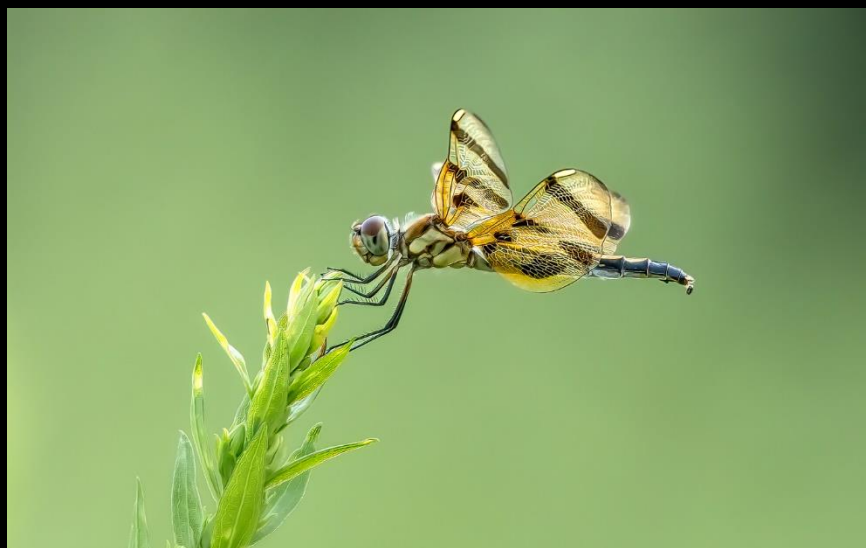
B HALLOWEEN PENNANT DRAGONFLY