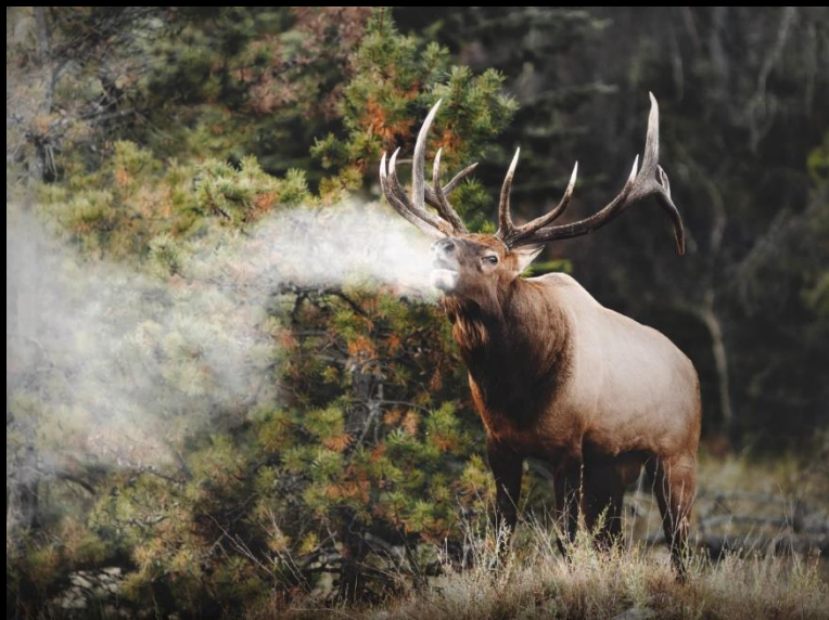
A BULL ELK CALL