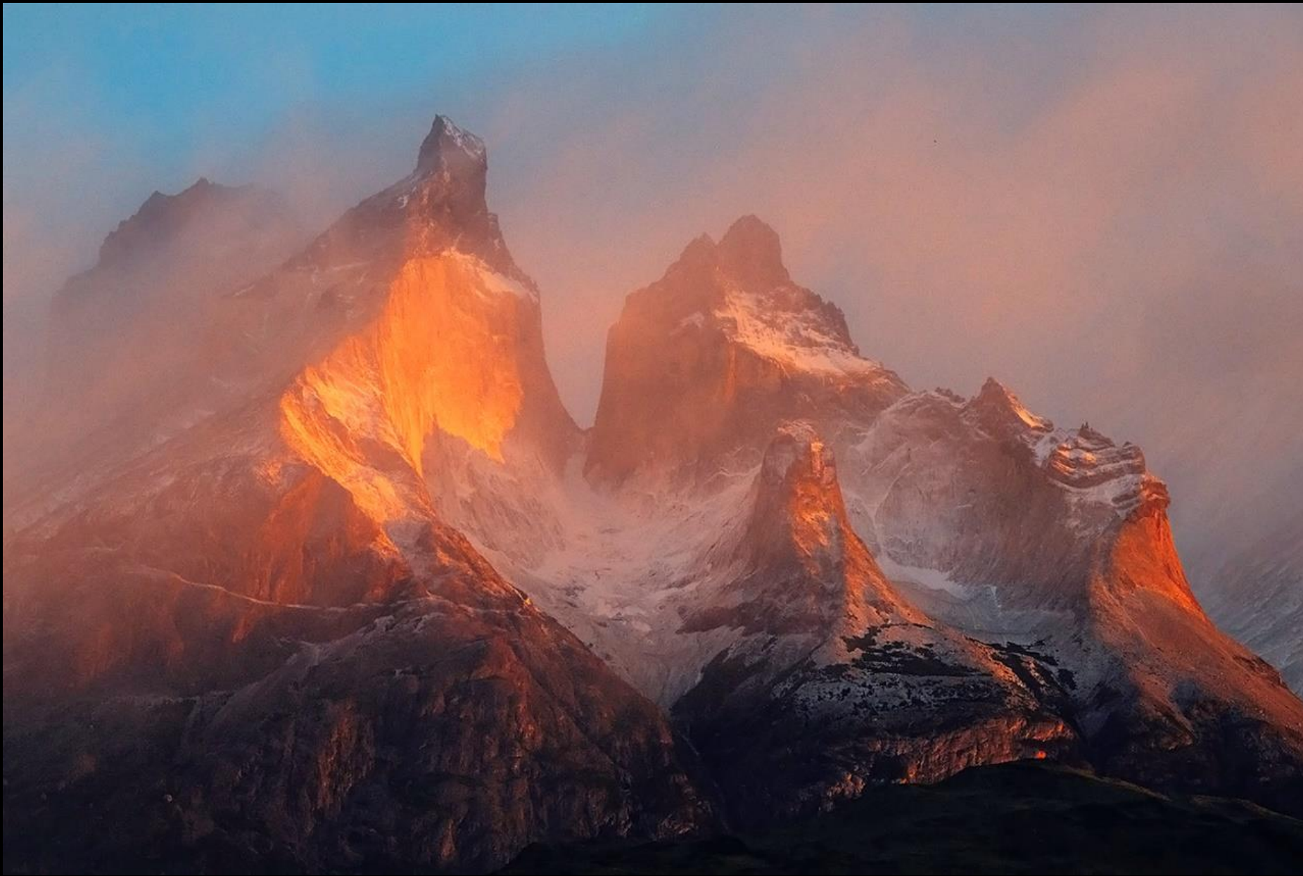
LOS CUERNOS DEL PAINE