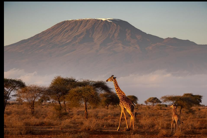
M AMBOSELI DAWN