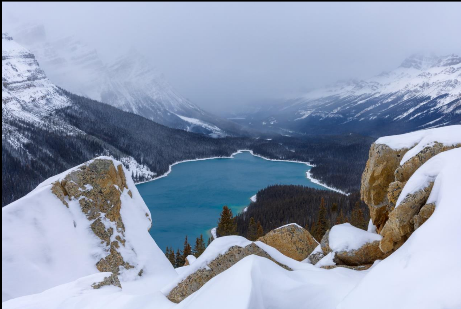
PEYTO LAKE THROUGH A NATURAL WINDOW