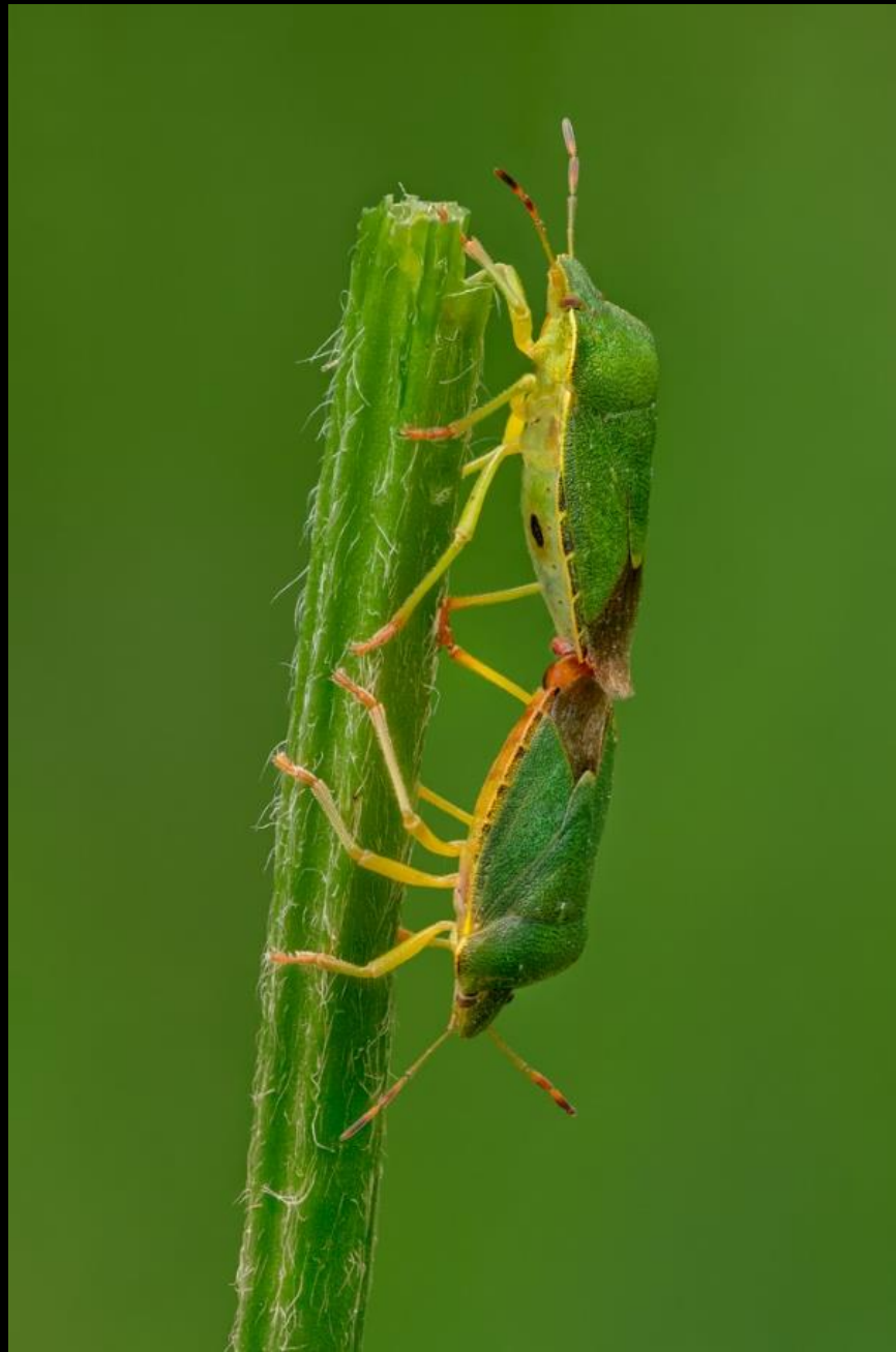
MATING GORSE SHIELD BUGS