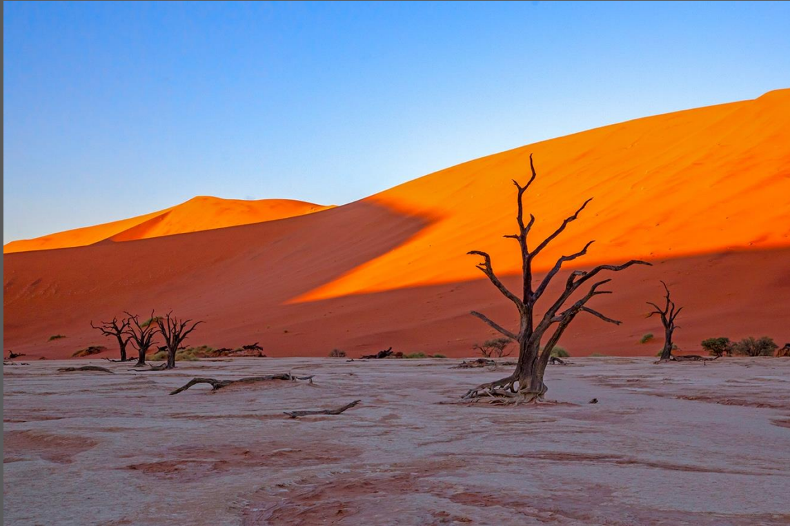
RU – Sossusvlei Namibia