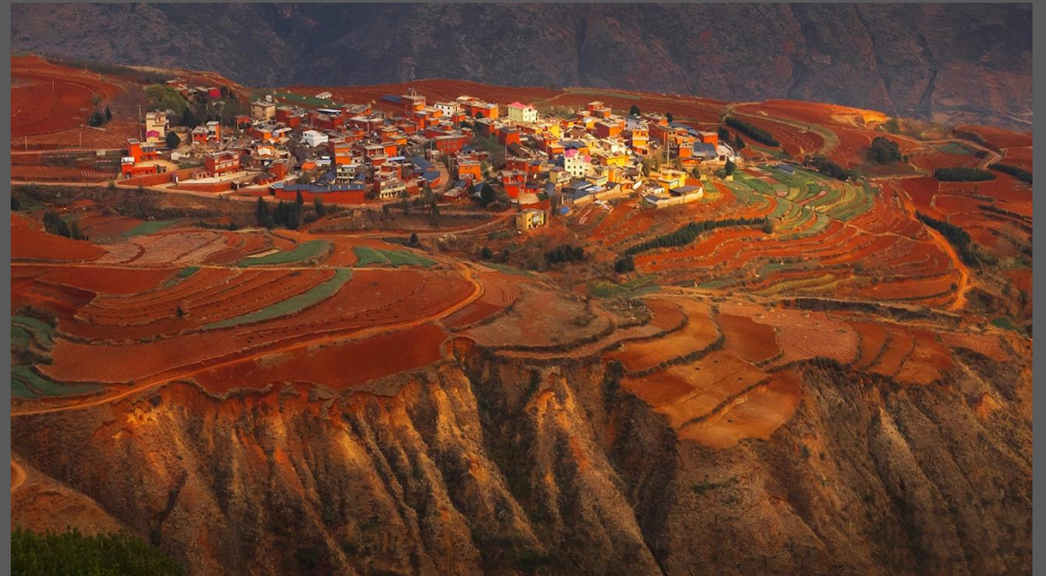
HM – Redland Kunming China