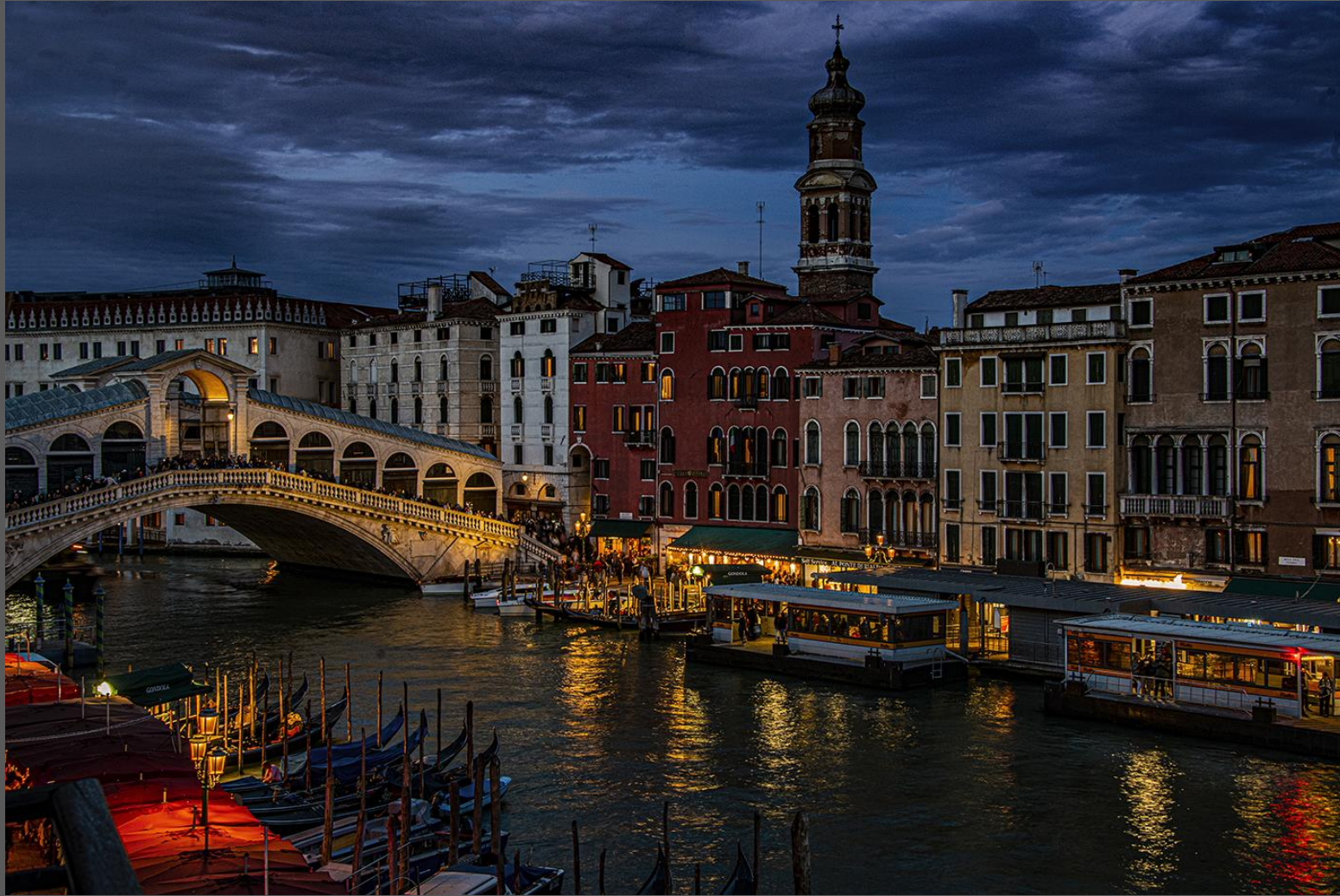
TOP – Venice Matt Frepp