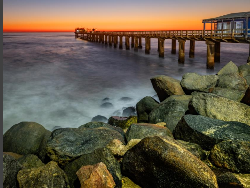
Twilight at Jetty 1905