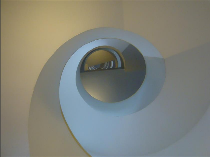
Up the Lighthouse Malgorzata Reszka